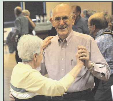
Chintimini Senior Center

The Friends group assists the City of Corvallis Parks and Recreation Department with improving the quality of life for Corvallis residents. We work with the Parks and Recreation Department to help provide affordable recreation, health and enrichment programs for all ages, abilities and income levels.