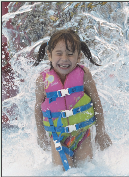
Osborn Aquatic Center

Provide financial support above and beyond what is included in the City of Corvallis Parks and Recreation Department annual budget