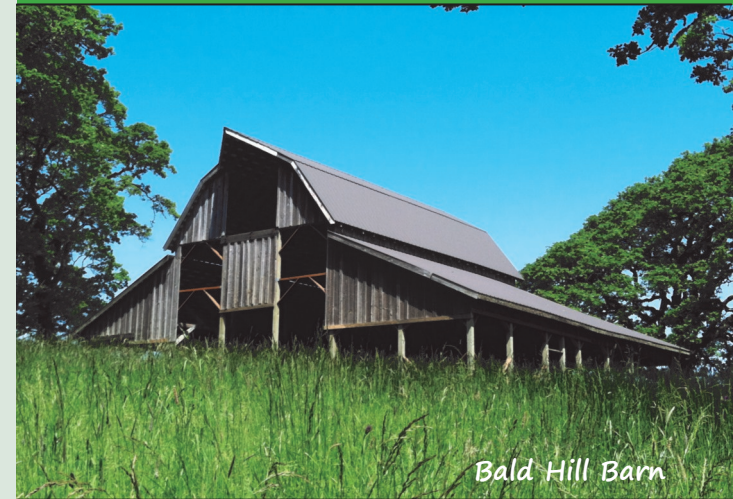
Bald Hill Barn

A non-profit organization supporting parks, recreation and natural areas in Corvallis